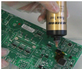
1) Apply indicator