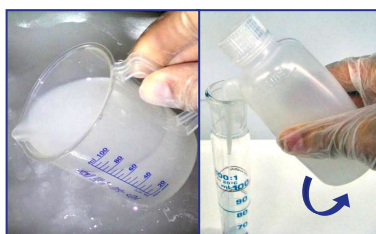
1) Sampling / Decanting