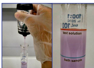
2) Adding test solution