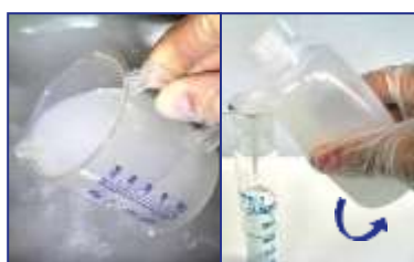
1) Sampling / Decanting