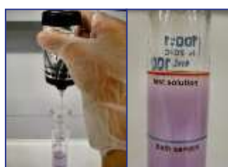
2) Adding test solution