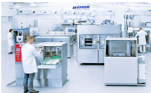
Machine Test Center