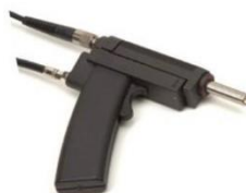
MX-DS1* Desoldering Hand-piece STDC Cartridges