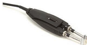
MX-PTZ* Precision Tweezer Hand-piece PTTC Cartridges