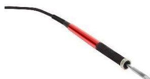
MX-H6-HTD High Thermal Demand Hand-piece HTC Cartridges