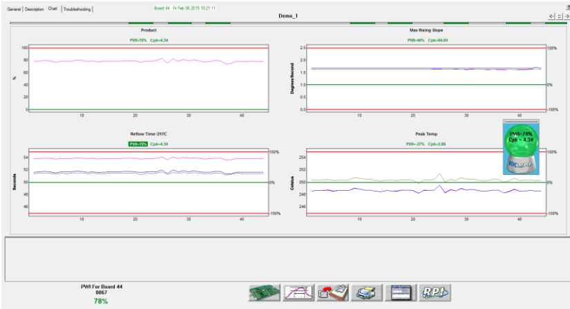
Automatic SPC Charting with Real-time CpK